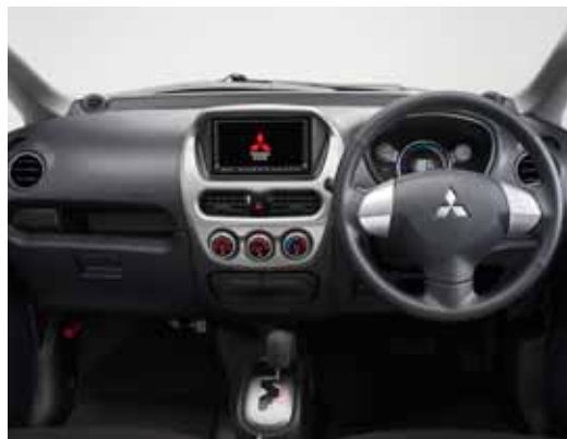
AVN option shown